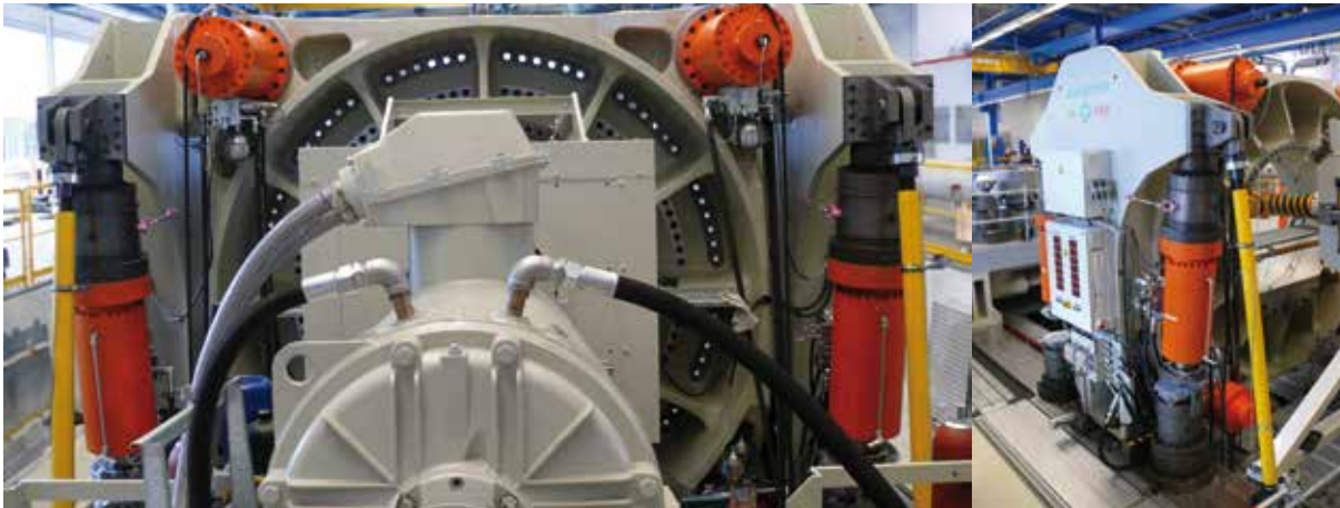
2 | Eight hydraulic cylinders by Hänchen achieve the loads and momentums rendered under real conditions in the wind energy installation.

wind energy installations with up to 3 MW. This value was raised to 6 MW later on, because large installations are frequently used by offshore technology. The actual system for a customer was the starting point in this context. Each test cycle of ASTRAIOS adheres to the respective parameters specified by the customers and the coordinate system for strains by Germanische Lloyd and considers the corresponding forces and momentums. The systems have bearings with an outer diameter of 3200 mm. The 16 m long, 6 m wide and 6 m high test stand accommodates single bearings, rotor bearings and pitch-control bearings with an outer diameter of up to 3500 mm and a weight of up to 15 t. In the past, tests were only possible with bearings of up to 700 mm. The current system allows checking calculations of up to 7000 mm with high accuracy through extrapolation.